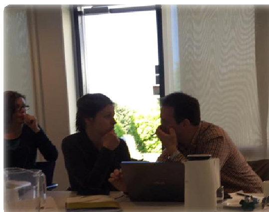
The second transnational meeting in Aarhus