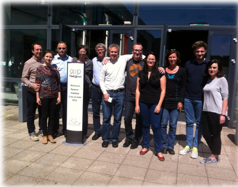
The second transnational meeting in Aarhus

Newsletter 03 is planned to be published around the end of January 2016, after the meeting in Valencia, with its main content on the results of the guidelines and the handbook and the development of pilot course.