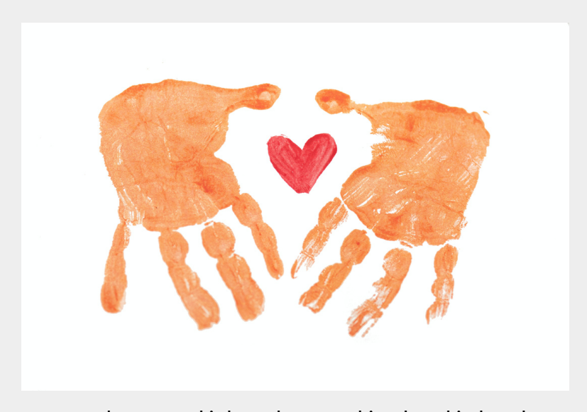
Employers and job seekers working hand in hand

PP: All services related to the development of the labour market that Работоспособни.бг provides are completely free of charge for both employers and job seekers.