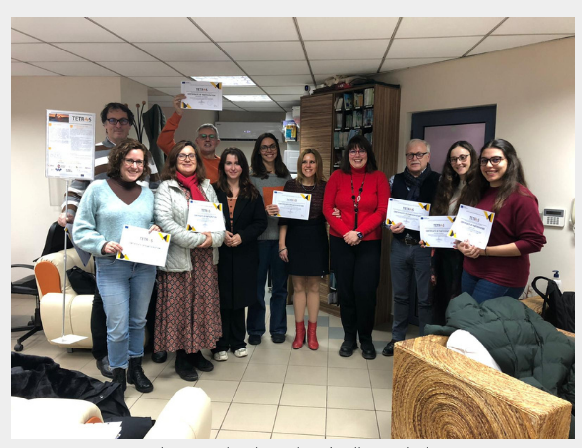
Second Transnational Meeting Plovdiv, 11-12/01/2023 -Team Group proudly shows certificate of attendace

The TETRA-S Project is committed to making a positive impact on the lives of individuals with cognitive needs, and the progress made so far is a step in the right direction.